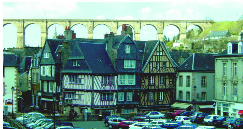
Half-timbered houses on the Market Place