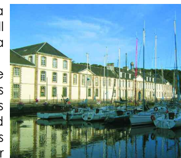
The old tobacco factory and riverside

For a fascinating glimpse of Morlaix's social and commercial history, visit No.9 Grand'Rue , a wonderful house of a unique architectural type, often called 'pondalez'. This remarkable